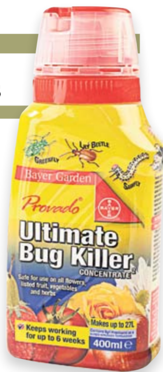
WORKS ON A NUMBER OF PESTS AND MOST PLANTS, INCLUDING VEG

Bayer Garden Provado Ultimate Bug Killer For use on all ornamental plants and listed fruit, vegetables and herbs. Format RTU & concentrate Active ingredient thiacloprid Protects up to six weeks Size RTU: 1-litre, 3-litre; concentrate: 400ml, makes up to 27-litres Price guide 1-litre £4, 3-litre £12.99, 400ml £7.99 Concentrate cost per litre 29.6p