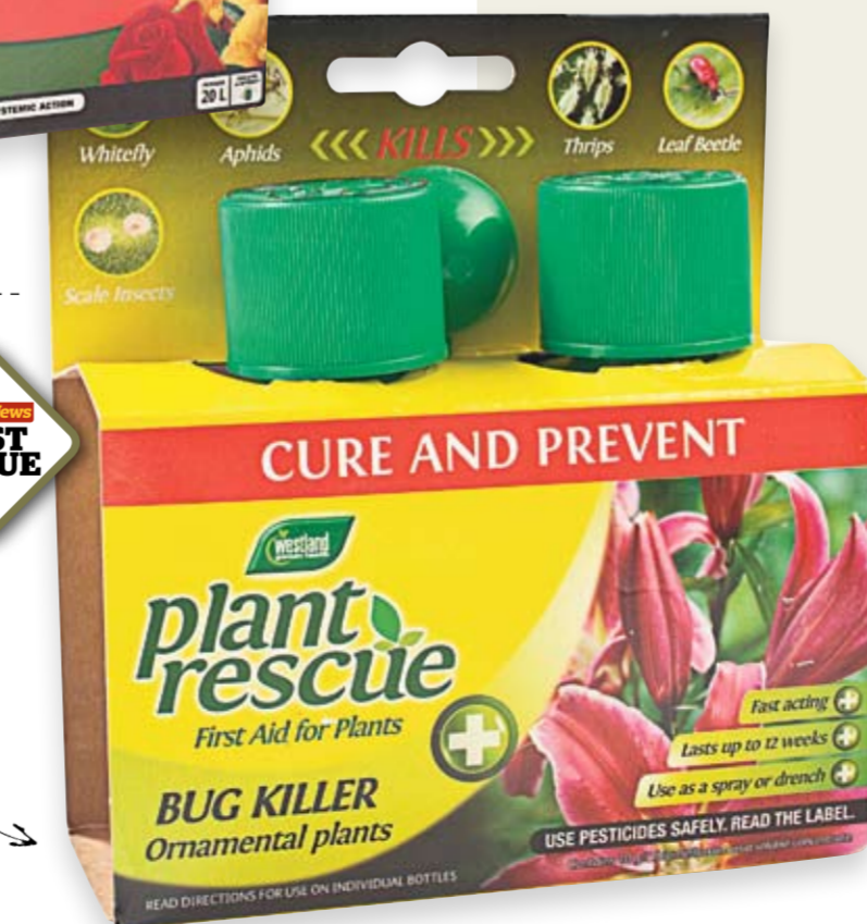
GOOD VALUE WITH ADDED FEED FOR ORNAMENTAL PLANTS

For use on all ornamental plants. Added leaf feed. Format RTU & concentrate Active ingredient RTU: thiamethoxam & abamectin; concentrate: thiamethoxam Protects up to 12 weeks Size RTU: 750ml; concentrate: 2x100ml, makes 20-40-litres, depending on pest. Price guide RTU £4.99, 2x100ml £7.99 Concentrate cost per litre 20-40p