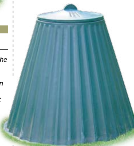
THE ROTOL COMPONSTER COMES READY TO USE

The Rotol Composter comes ready to use. Made from high strength 100 per cent recycled polyethylene. Secure easy access lid for insulation. ● Sizes 76cm (30in) diameter at base, 46cm (18in) at top, 77cm (31in) high; 102cm (40in) diameter at base, 46cm (18in) at top, 77cm (31in) high ● Capacity 220 litres; 300 litres ● Supplied by Harrod Horticultural